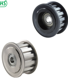
中心軸承型 (2PCS軸承時) WWBK TWBK NWBK